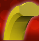
Cross-section of standard Supa Seal