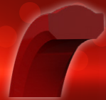
Cross-section of high pressure Supa Seal