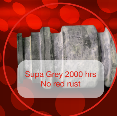
Supa Grey < 12µm

(ASTM B117, BS 7479, ISO 9227, NS DIN 5002)