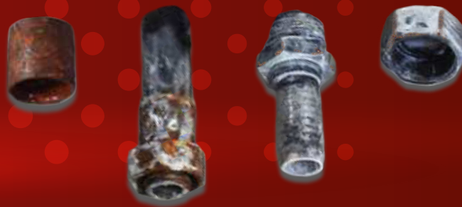
Competitor 1 after 1,000 hours ASTM B117 (ISO 9227) salt spray test