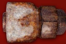
Competitor 2 after 1,000 hours ASTM B117 (ISO 9227) salt spray test