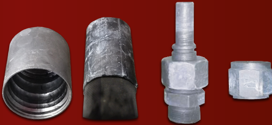
E-Coat 1000 after 1,000 hours ASTM B117 (ISO 9227) salt spray test